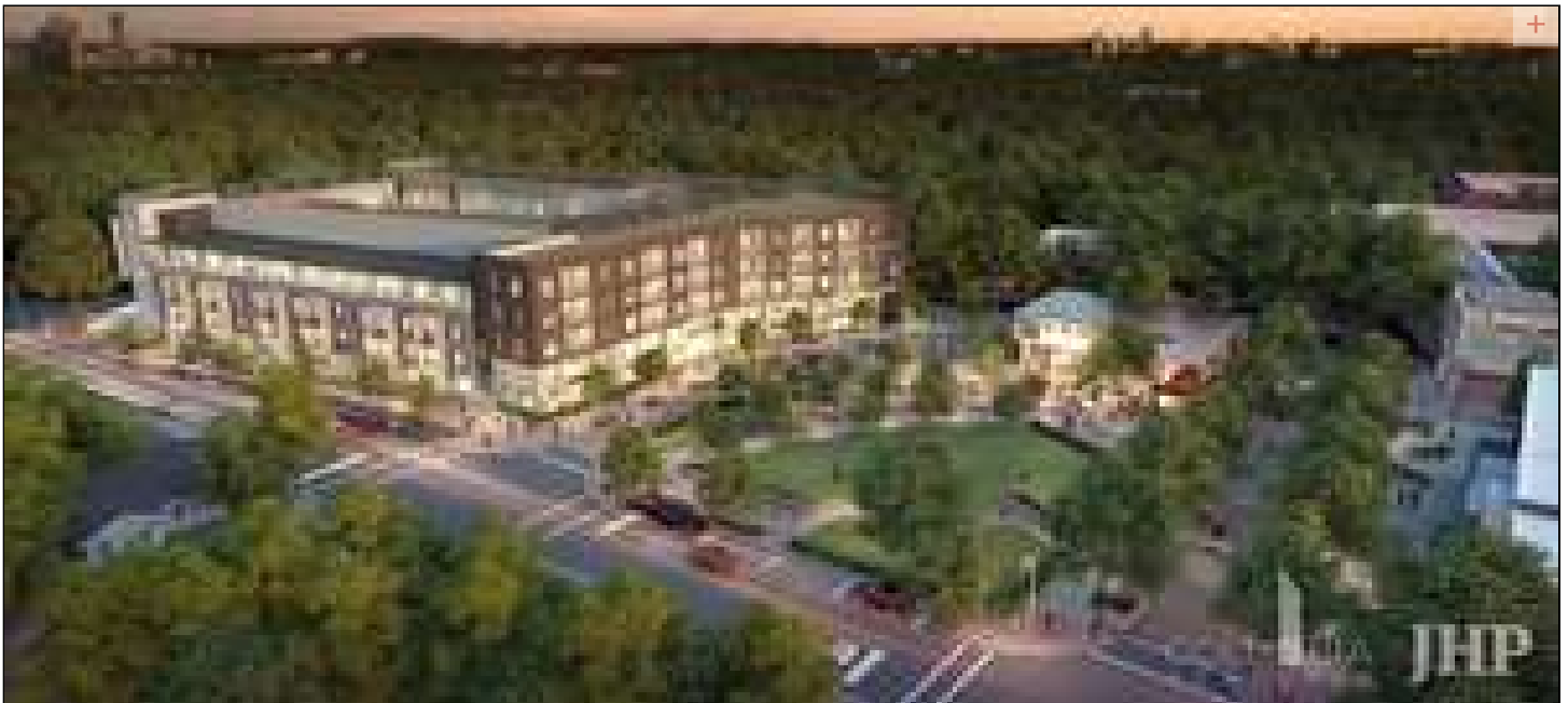
A rendering of Spoke, a transit-oriented development on MARTA land at the system's Edgewood/Candler Park station.

MARTA's push for private-sector development at key stations comes as metro Atlanta businesses and many residents increasingly seek locations near transit. Spoke officially broke ground last month.